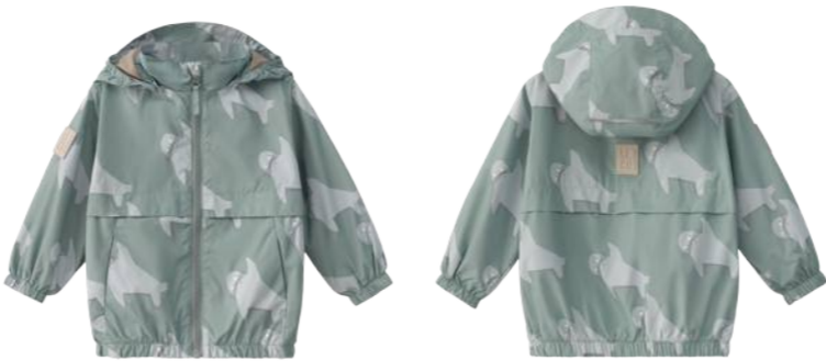
sea tot green