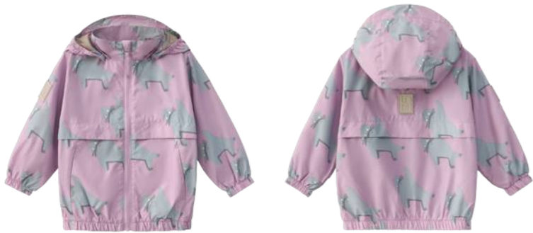
sea tot pink