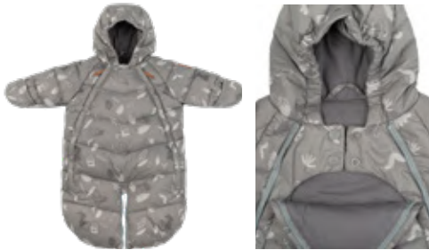
Dusty Gray Forest