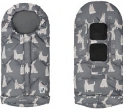
Old Friends Gray