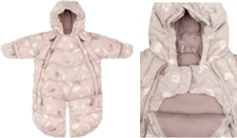
Dusty Pink Forest