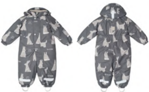
Old Friends Gray